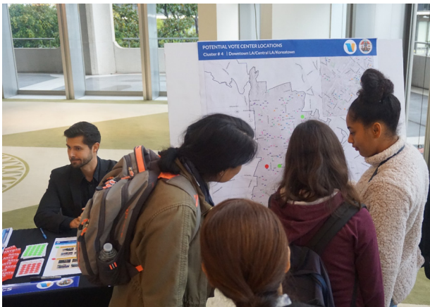
Arts for LA – Music Center’s Dorothy Chandler Pavilion

In January our office presented at 19 various community meetings which included public meetings surrounding the Vote Center Placement Project, League of California Cities General Membership Meeting, Los Angeles Chamber of Commerce Government and Fiscal Affairs, Florence and Firestone Community Leaders Meeting, La Cañada-Flintridge City Council meeting, March Torrance City and County Government Day and Palos Verdes Democratic Club.